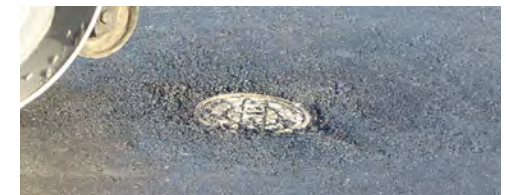
Manholes, Water Valves & Drains

EZ Street Asphalt is Guaranteed Permanent!