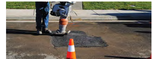
Utility Cuts, Overlays & Edge Repairs